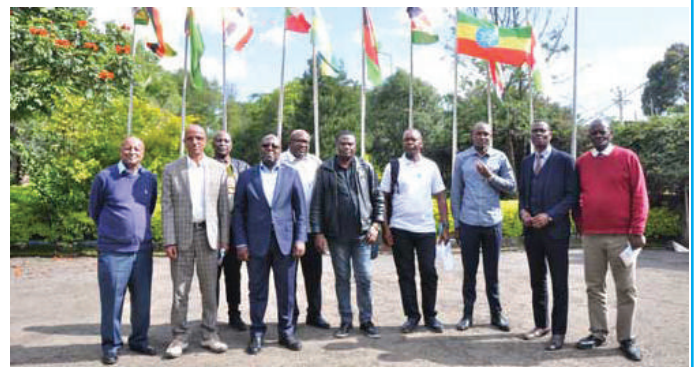
Group Picture After the Meeting