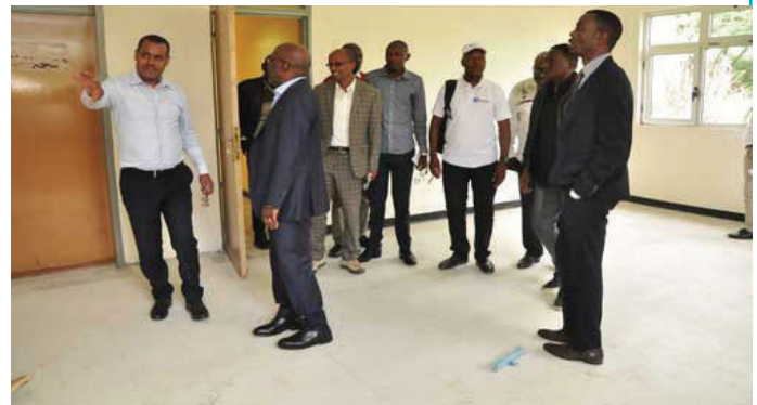
Delegates Visiting the ALLPI Headquarters Building which is under major maintenance