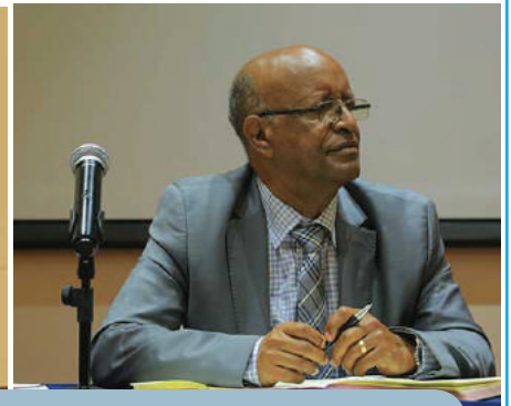
Partial view of ALLPI Experts making presentations during the event