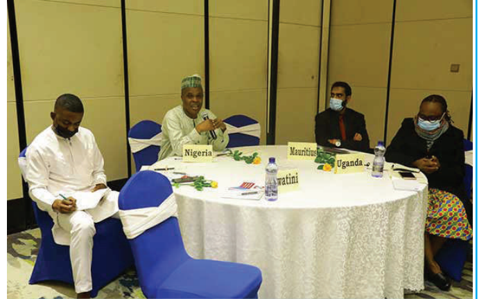
Partial View of participants during the Question and Answer Session