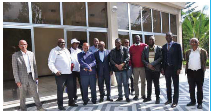
Group Picture After the Meeting