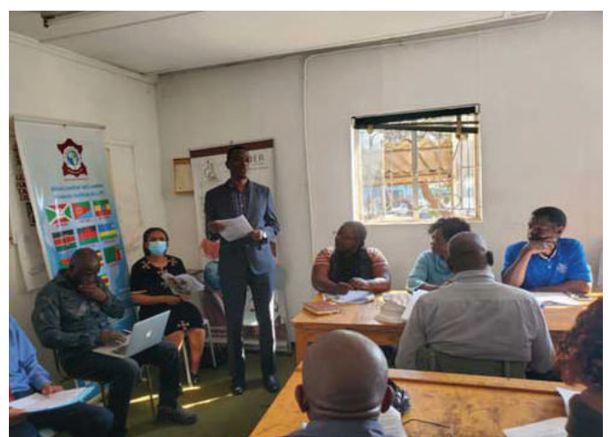
ALLPI program and participants Introduction