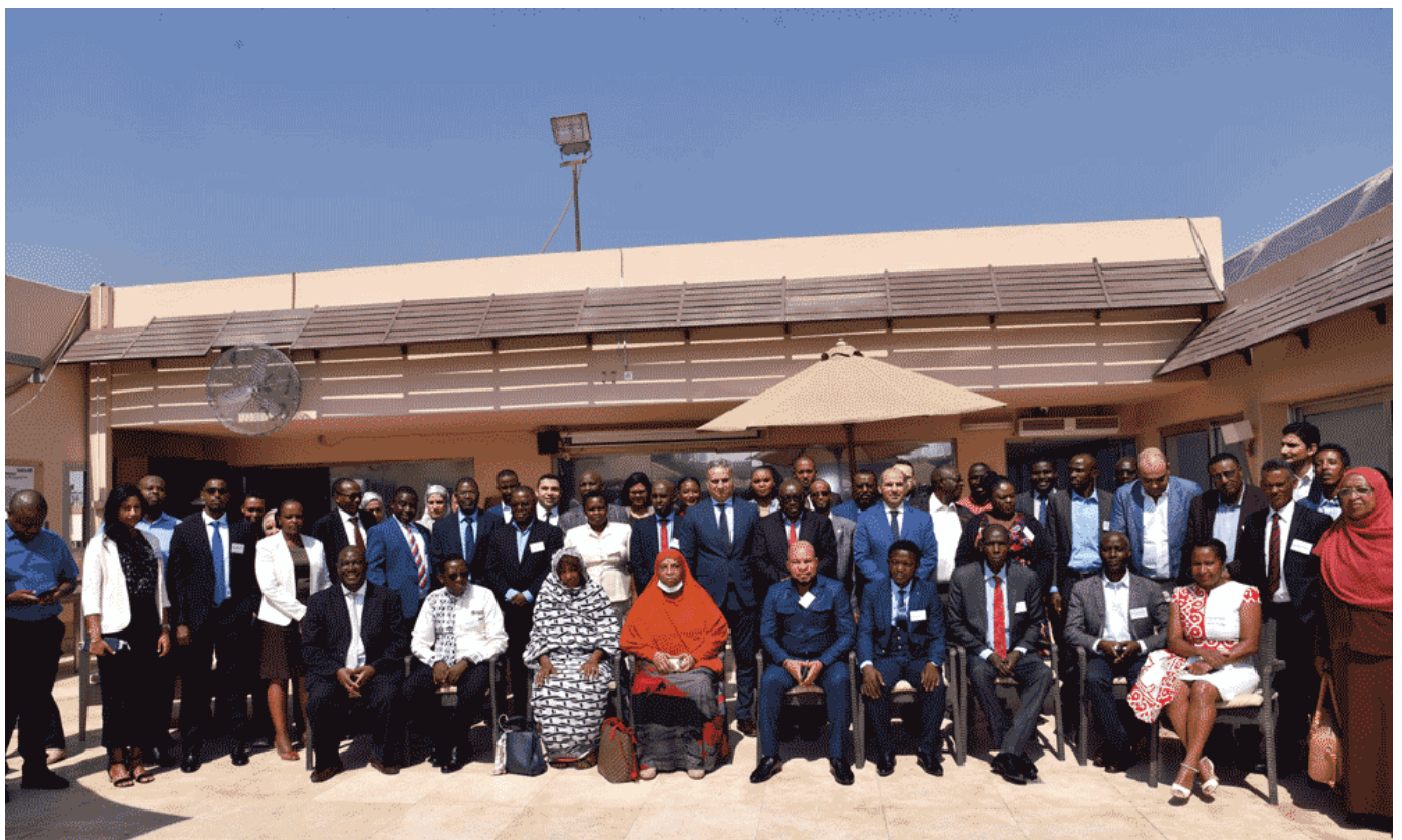
Partial View of the Research Forum