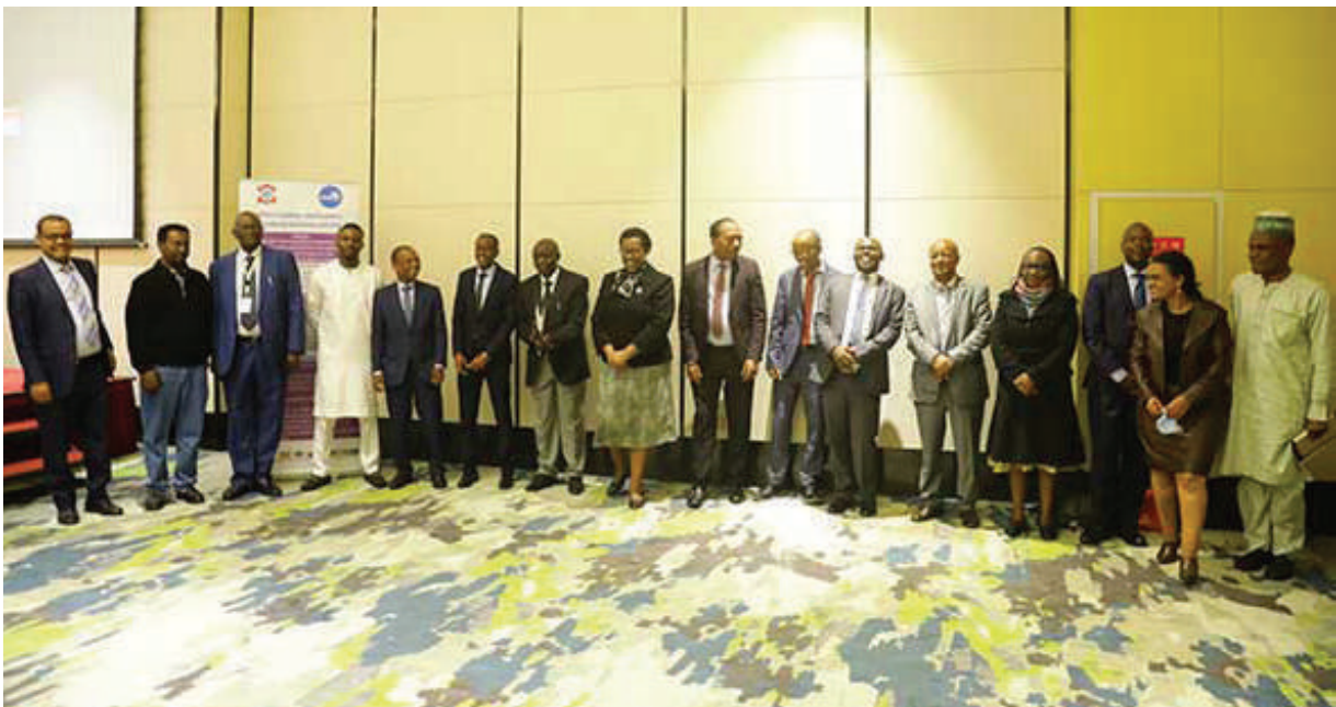
Partial View of the Breakfast Meeting

ALLPI facilitates experience sharing and learning visit by DRC delegation to the Ethiopian Leather Sector