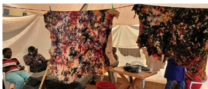
the leathers are being dried using air drying method