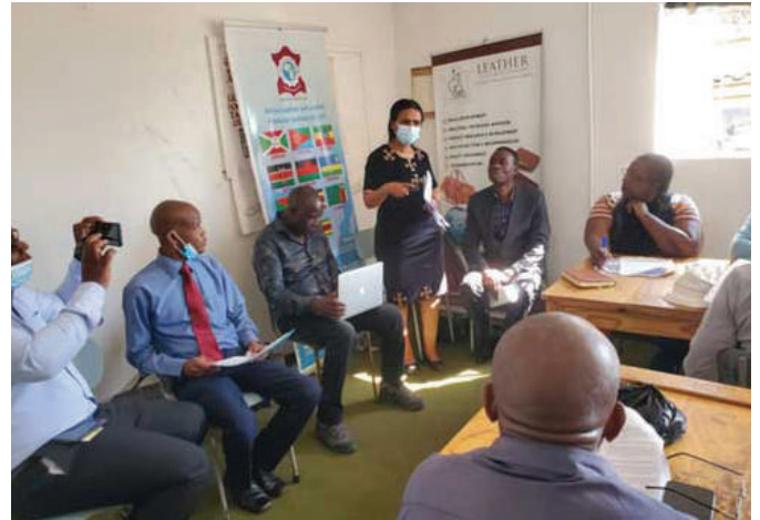
LLPI program and participants Introduction