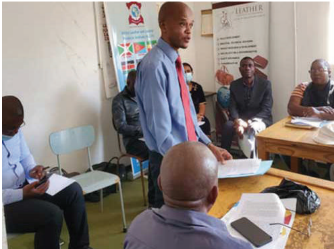
Partial view Official opening of the Program