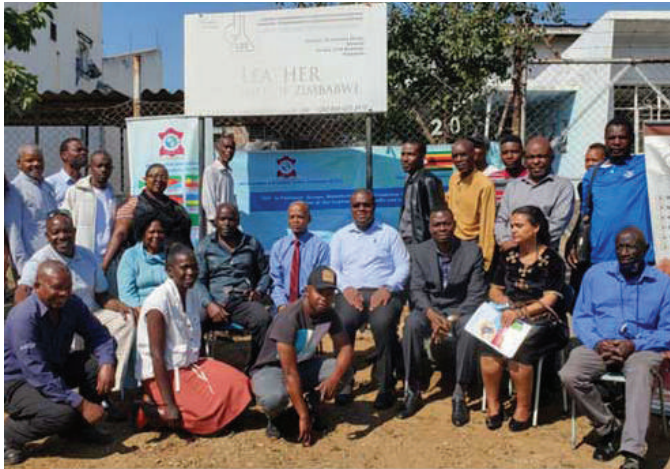
Group Photo during the opening session