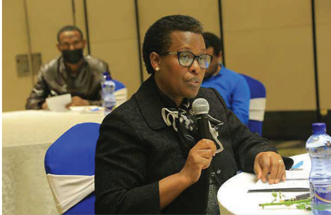
Partial View of participants during the Question and Answer Session